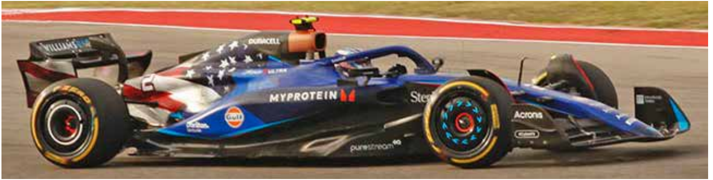
Logan Sargeant during practice at COTA.

In the thrilling world of auto racing, certain individuals captivate audiences with their skill, determination, and the ability to push boundaries; and in the past American Formula 1 racing drivers have achieved those attributes. While the majority of F1 drivers historically have come from Europe, there have been notable American drivers who have left their mark on the sport. One of the most iconic American Formula racing drivers is Mario Andretti.