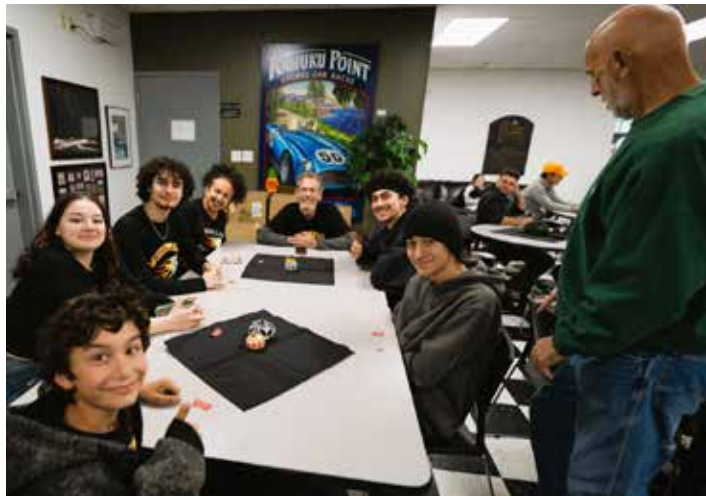
The Woolley Gang!!