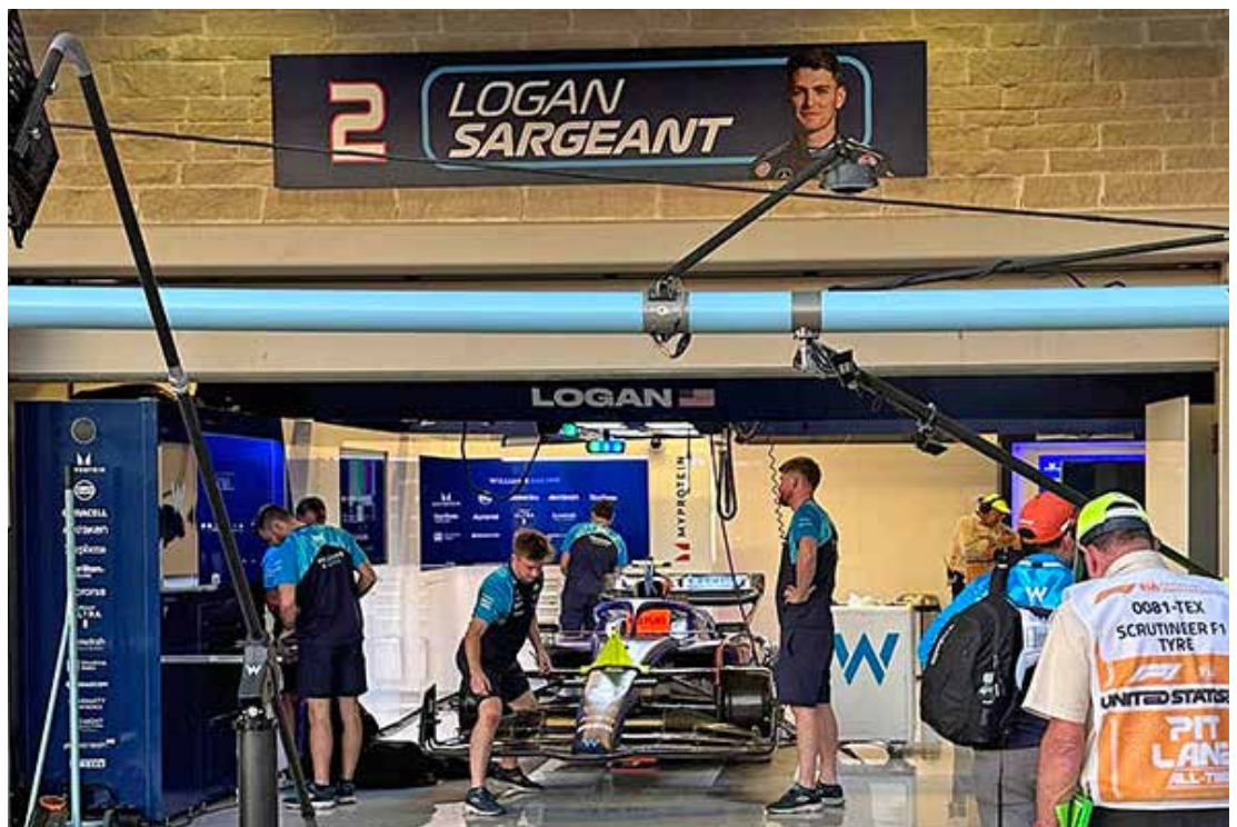
The Williams Crew preps Sargeant's FW45 for competition.

Overall, participating in SCCA racing will provide upcoming racers with a platform to showcase their talent, develop skills, and build a foundation for success as an auto racer. The SCCA offers the necessary experience, exposure, and connections which will ultimately play a vital role in anyone's journey to becoming a professional auto racer.