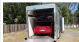
2007 Pace Shadow Ramp Stack, Bumper,

Pull 3 Dexter 6k axels, all wheel brakes, 25 ft box, 5 ft tongue, Double side doors 58" x 80" total, 20 ft awning, needs new cover, floor to ceiling 105", 81" between wheel wells, rear ramp 98" + 18" extension, 4" beavertail, includes new 5500w Generac portable generator. $12,500.00 obo. Larry 707-462-9088 1610