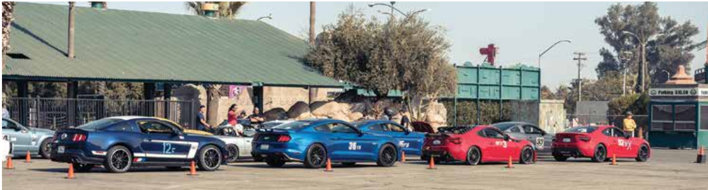
Drivers await their turn at the Fresno SCCA Season Finale.

November 9 and 10 marked the season finale for the Fresno SCCA, as the central valley crew stormed the Fairgrounds asphalt one last time in 2019 for an autocross doubleheader. Saturday's autocross and Sunday's enduro-format autocross challenged drivers to edge the competition one last time to stake top season honors and lay claim to a trophy. And as the checkered flag finally waved on what may have been the club's most competitive autocross season to date, those in attendance witnessed the closest ever finish in Fresno SCCA's recorded history.