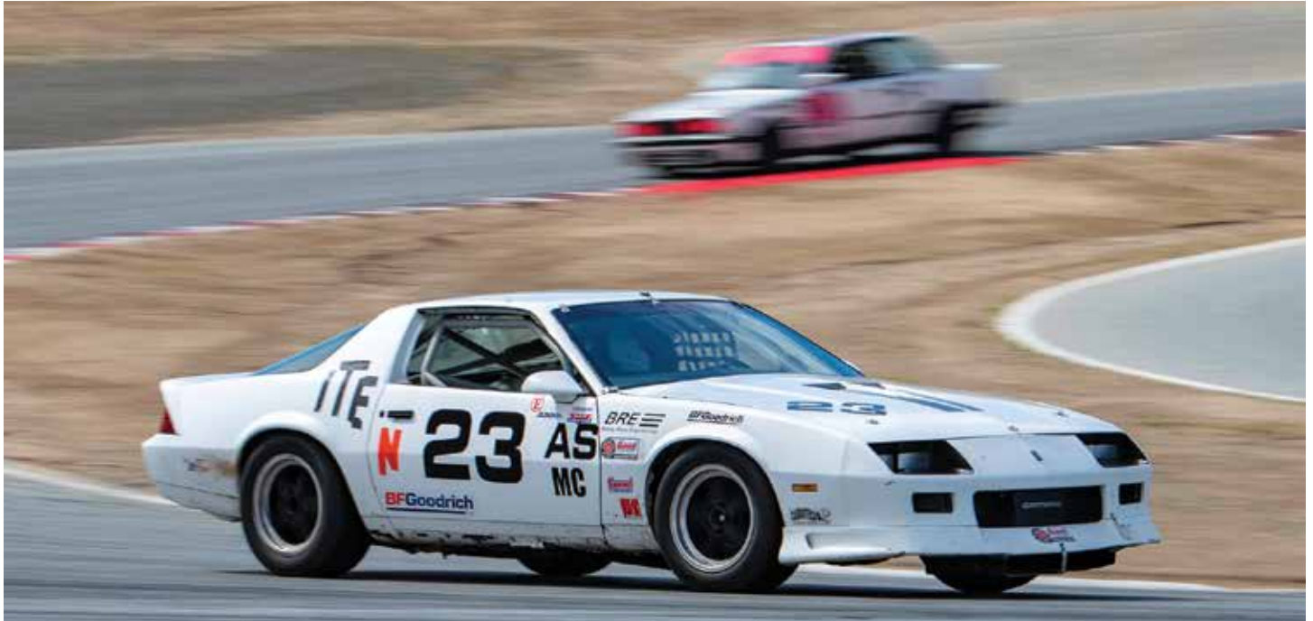
SS Regional Champion Charles Laster

Group three cars are usually referred to as the ground pounders. The reason for this name is the loud noise they make as they motor around the racetrack. Before the days of noise pollution these ground pounders really made the earth beneath your feet pulsate. The sheer power of these cars makes it so some of them cannot compete at tracks with severe noise restrictions, which limits the numbers of cars that can race with us.