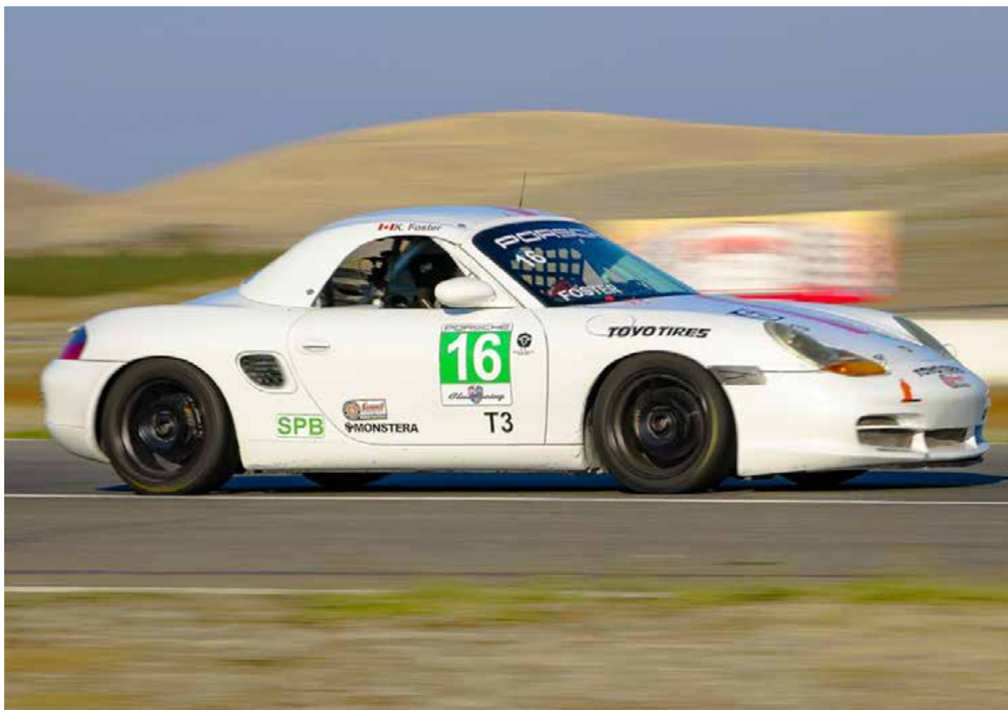
Kris Foster Porsche Boxster going into Turn 1.