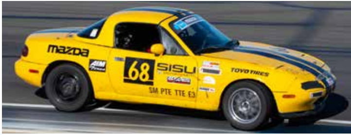
Justin Cone raced hard all weekend.