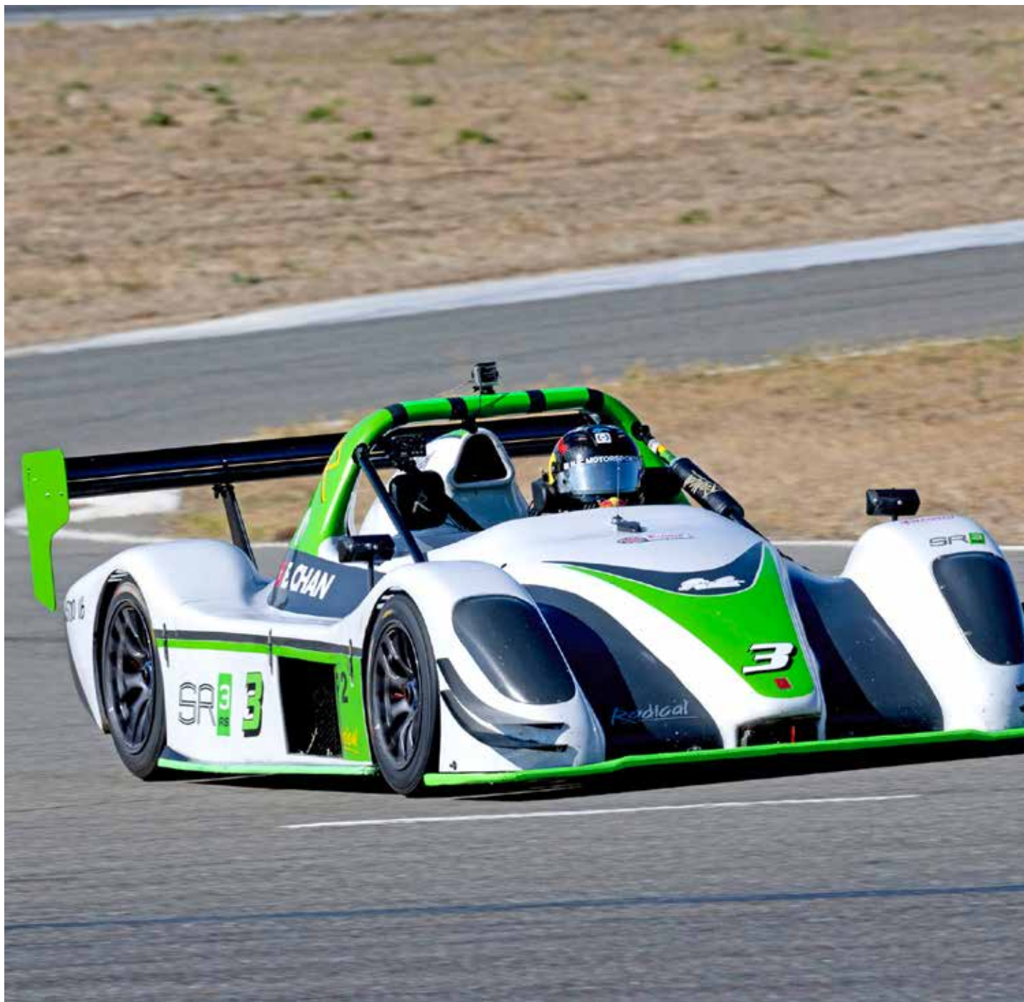
Eddy Chan goes through turn 8 on the 1.9 mile course.