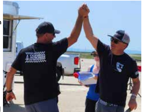
Drivers at the SCCA National Tour at Crows Landing who won their class picked up trophies from the SCCA National office along with a win sticker for Round 1 of the California Autocross Championship.

Championship points could be tracked throughout the year on the series' website www.calautoxchamps.com and after the checkered flag few on the final event of the season the State Champions were crowned.