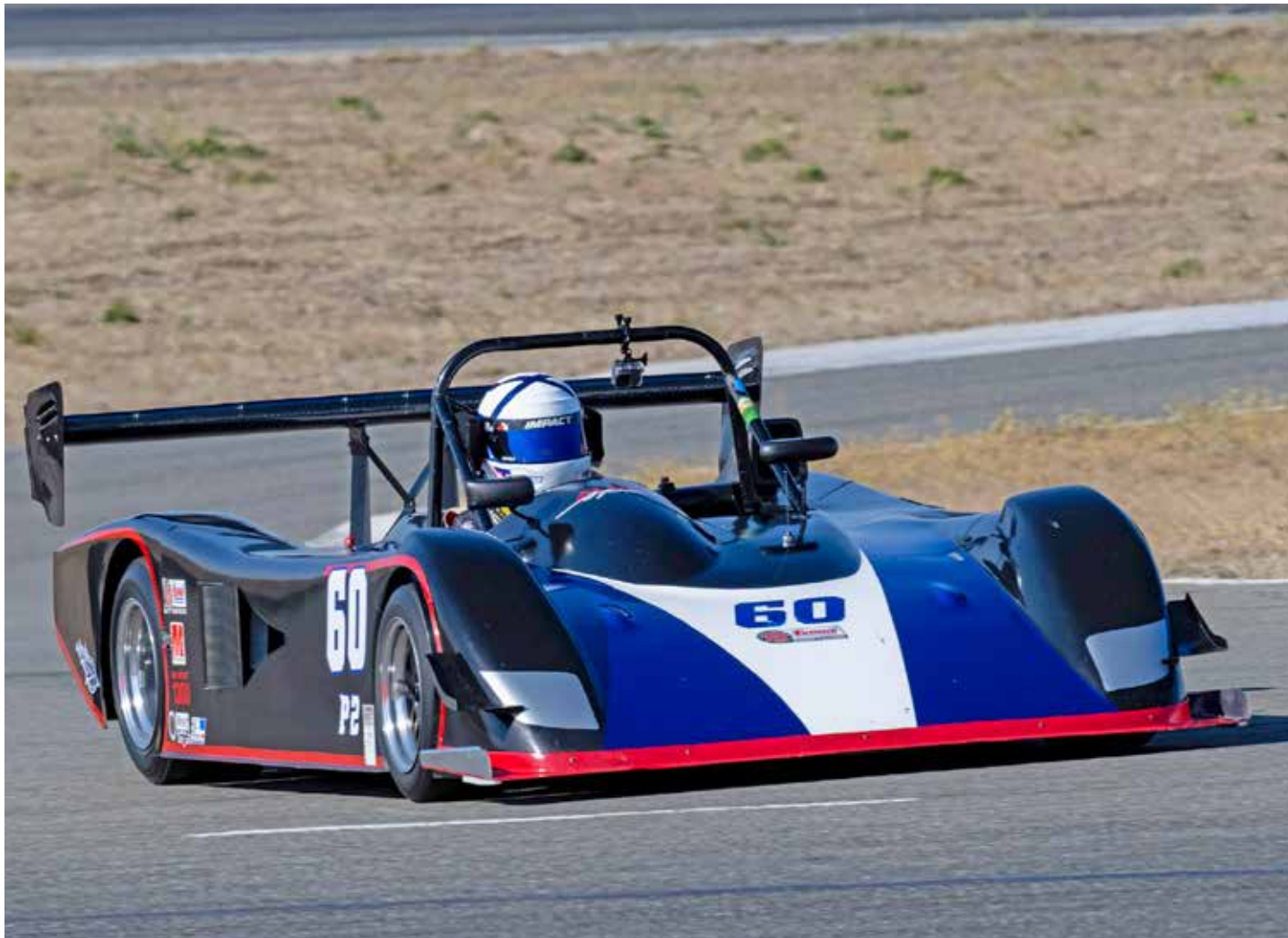
Troy Tinsley P2 Regional Champion.

The weather forecast for Saturday predicated sunny but windy conditions. Saturday morning was exactly that - sunny and windy! Plus very cold. The first group out was probably the group that is most affected by the colder conditions. The Prototypes need track temperature to get their tires up to the proper operating temperatures, plus the wind was blowing from the North to the South, which meant the cars would have a tail wind going into Turn 1. For those that have not driven Thunderhill Turn 1 is the pucker factor turn on the track. It is a left-hand turn a little less than 90 degrees that goes slightly uphill. The uphill exit allows the driver to carry more speed than the brain says at which the corner should be taken. With the tailwind, I heard some of the drivers state the wind was blowing them sideways as they changed directions from South to East.