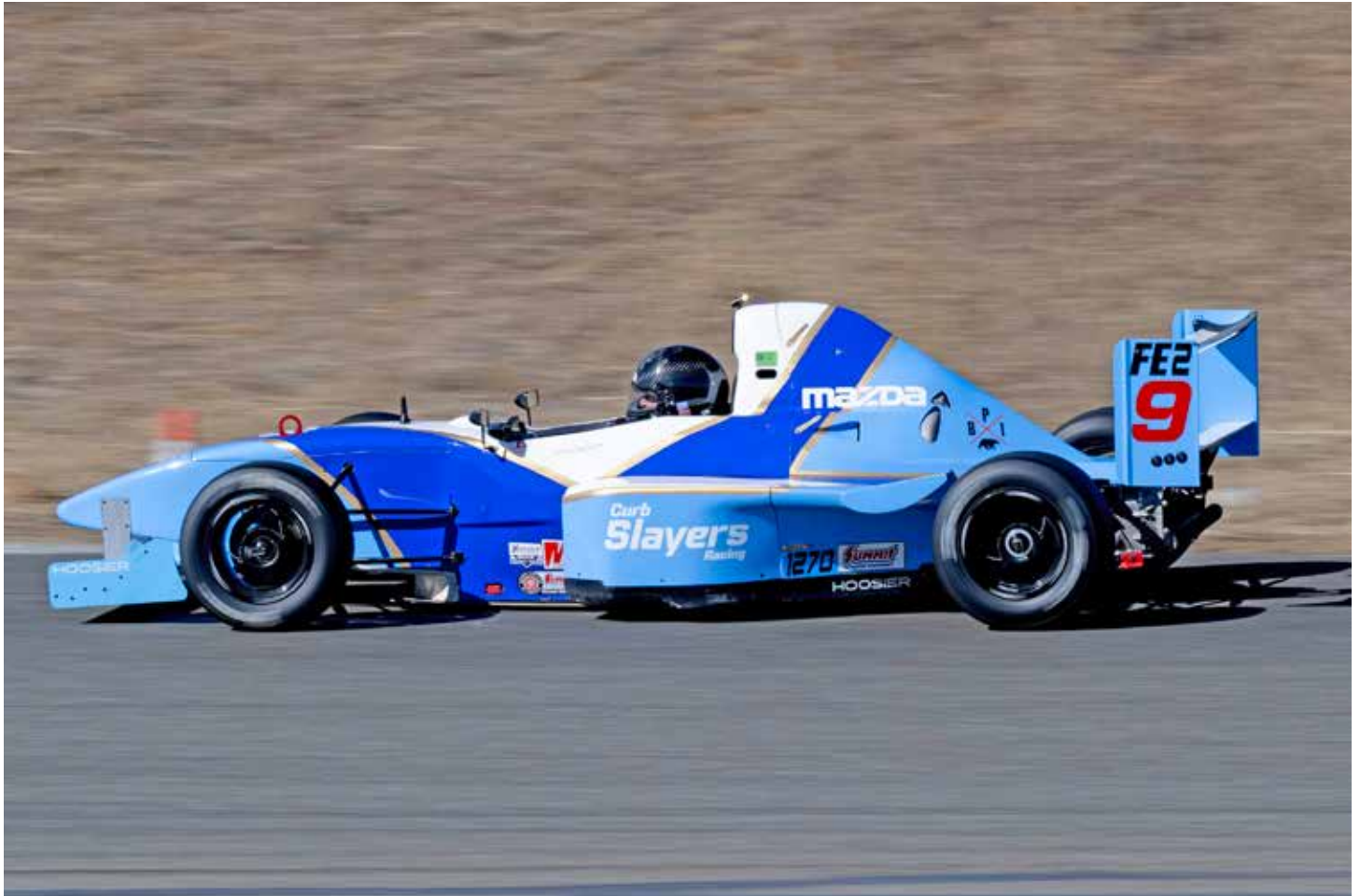
Eric Boucher returns to SCCA racing after a layoff.