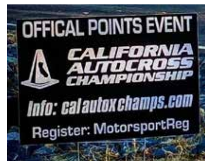
If you saw the "Official Points Event" sign at one of your local autocrosses you were attending a round of the California Autocross Championship.

The series was a success and will be back in 2024 expanding the calendar and its reach throughout the state. There are rumors of including the Lone Pine Time Trials as one of the Rounds for 2024. Details are still being worked out as regions setup their calendars for 2024. Look for pre-registration on MotorsportReg where registration for the series will be at a discount.