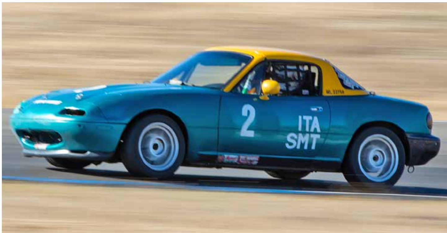
Ross Lindell won all three days in ITA.