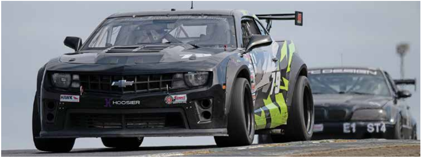
Clark Nunes took home a pair of T2 victories.