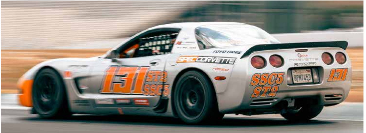
Craig Walker won SSC5 both days.