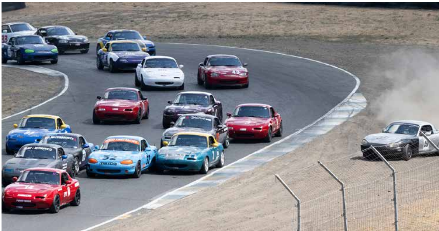
#59 Mike Ray exceeds the track limits at the start of the group 7 race.

This weekend we had the MX5 cup racers as part of our program. The MX5 cars are the modern version of the Miata with more horsepower and updated styling.