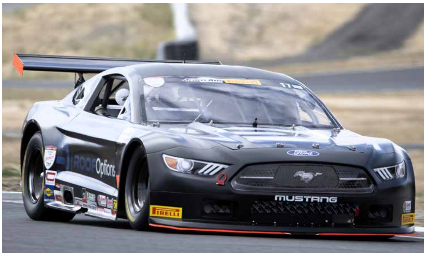
Timothy Lynn two overall race wins in group 3.