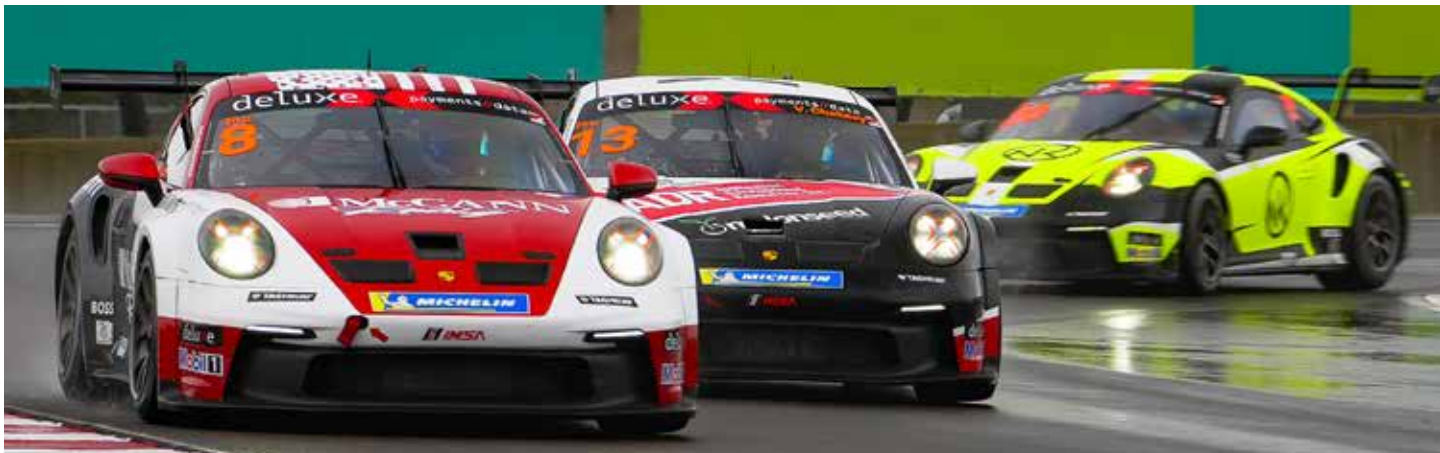
Are you a Porsche Fan? Rennsport is nothing but Porsches. Staffed by SCCA Volunteers.

Being a member of the San Francisco Region of the SCCA offers you privileges that most other regions do not. We staff at least five pro events every year. If you are a fan of the IMSA Sports Car Series, we have a place for you. If Indy Cars are your thing, then consider yourself lucky. There is room for you there too. If you long to see Can Am cars, Trans AM, or the V8 powered F5000 cars, we staff six days of Rolex Reunion racing that transpires over Speedweek in Monterey. So not only is the action on the track extra cool, pulling into the local