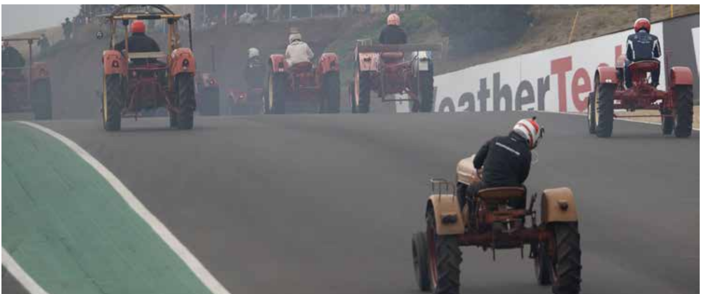
The fog you see is the lingering marine layer, it is not tire smoke.