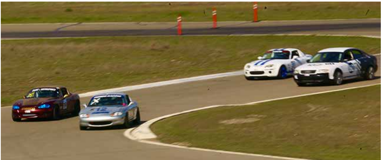
Students practice side by side driving while on pace laps. They also practice rolling starts.

Must have SCCA approved driver's gear and head protection. This includes a one piece racing suit that meets FIA requirements. Those