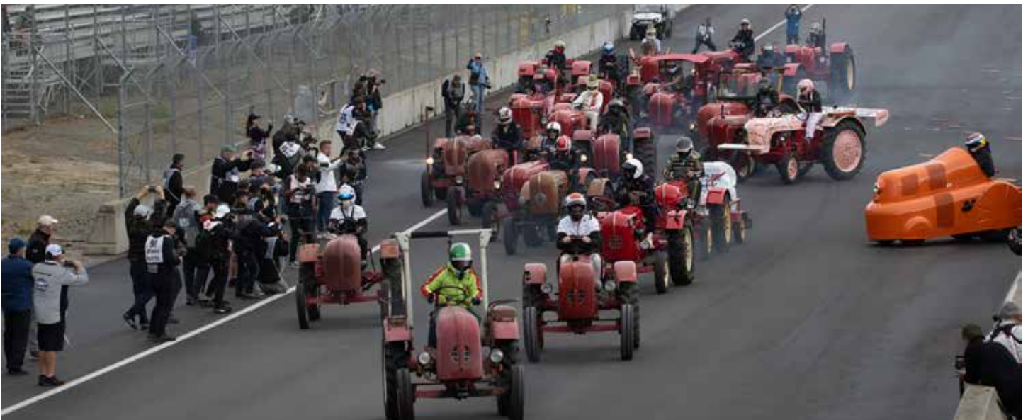
Porsche Tractor Race.

If you are a Porsche enthusiast, going to Rennsport is like a Christian's trip to the Holy Land. Rennsport features everything Porsche being driven in anger on a real race course. It is Porsche overload. These cars are the some of the best representatives of Porsche's speed and engineering. If your hero is Ferdinand Porsche, then going to