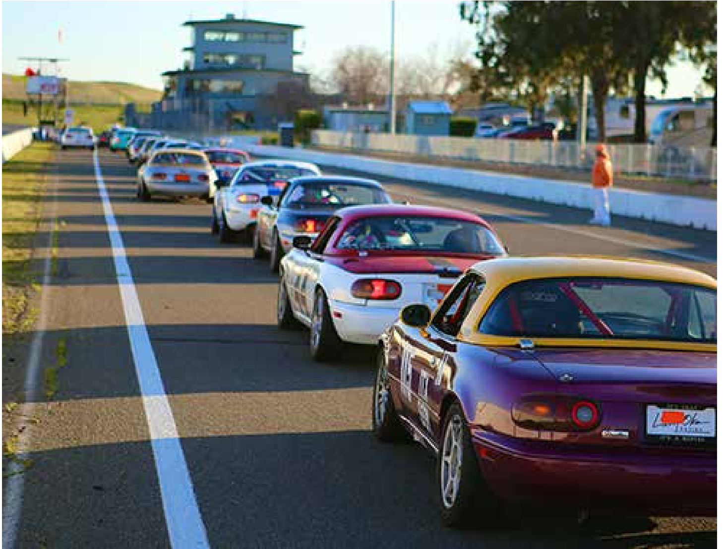
Red flag procedures are part of the training at driver's school.

At the end of the weekend, everyone that graduates get his/her Novice Permit signed off. The student is now eligible to compete in SCCA regional events. After successfully demonstrating racing competence over three races, the Novice Permit holder is granted a SCCA Competition Racing License.