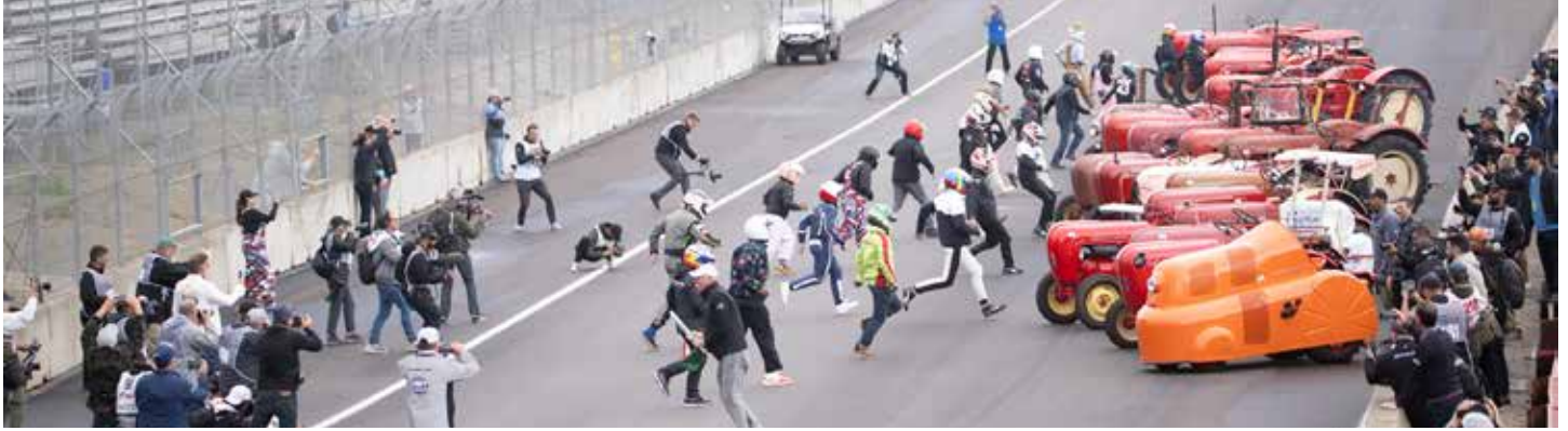
Running across the track to start the tractor race.