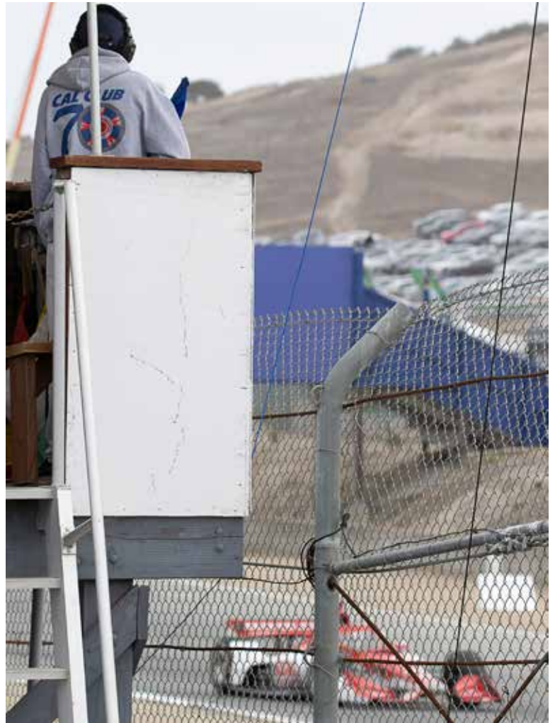
This volunteer gets a clear view of the action. the view on the ground is what the general admission folks get.

Let me ask you, do you have a racing habit that is getting harder and harder to pay for? Would you like to get premium viewing and not have to pay to get in? Would you like to be part of the action? Would you like to bring a friend for free? Would you like to get fed and a hotel room subsidized? If you are a racing junkie, I cannot imagine any other answer other than YES to all of those questions. I guess my next question - is what are you waiting for?