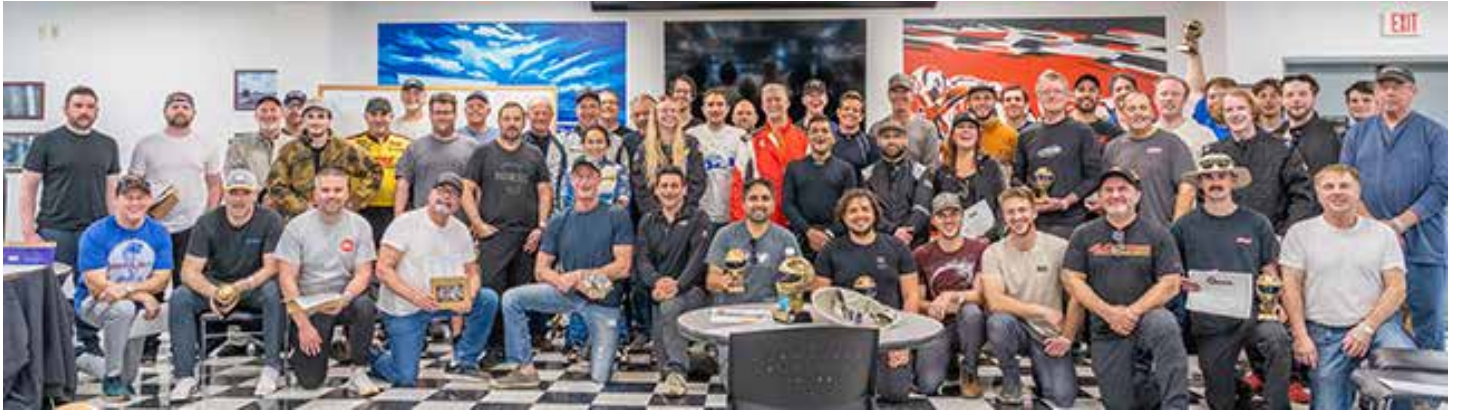
A proud group, the 2023 Graduating class.

The San Francisco Region of the SCCA continues with the annual tradition of hosting driver's school at the beginning of the race season.