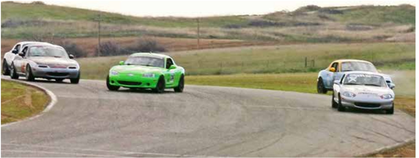
Learning the levels of adhesion is part of learning how to race. These drivers discover the off camber turn 3 at Thunderhill.

exact specs are available in the GCR, which is included in the cost of the Novice Permit.