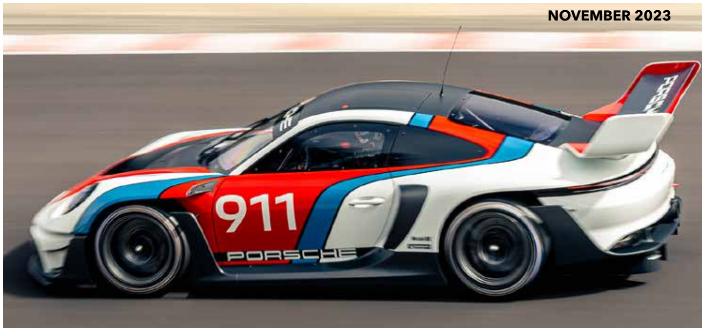
911 what's your emergency? I need more Rennsport.

Cover: Action at the 2023 Rennsport event. See how you can be involved in the story about Membership has its privileges.