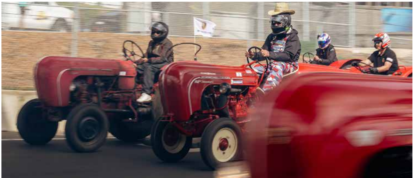
As you can see Cowboy Hats are optional.

spectators were treated with the various racing garb worn by the daring group of men. Some wore coveralls, some had full leathers, others wore short-sleeved shirts. Whatever the attire, none of it complied with FIA safety standards. As the twenty-two pilots made their takeoff, it resembled the start of the bumper car ride at the Santa Cruz Boardwalk - a bunch of cars all converging in one large scrum to see who would emerge out in the front. For those that still had the PTO engaged or had a tractor that did not feature an overdrive, the going was slow. In fact even the leaders pace could be timed with an hour glass. But this was not a race about speed, it was about camaraderie. Because in the amount of time it took to compete a half a lap, a person could ride alongside his competitor and carrying on a conversation on anything from the design philosophy behind the 356 Porsche to why Porsche insists on placing their motors in the rear. Sometimes it is not about speed sometimes, it's about bonding.