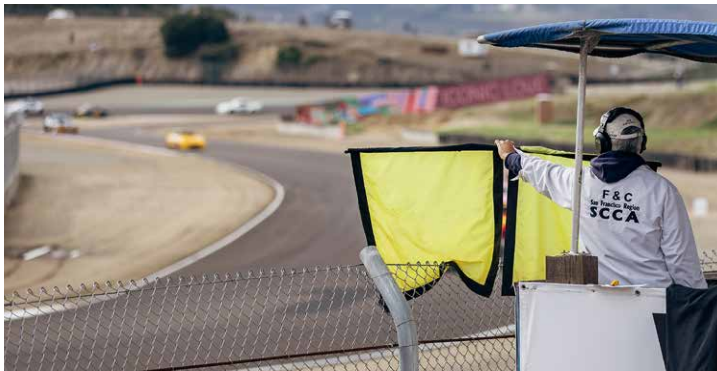
One of those cool white jackets I wanted as a young man.

I almost forgot the best part. At all of the Formula One races they have flaggers working the corners. Where do you think they get those flaggers? They come from the pool of experienced SCCA volunteers. Do not get me wrong. Flagging at Turn One in Las Vegas is not going to happen if you are not accredited. But once you prove yourself, flagging at the coolest racing events of the year is not out of the question. And there are other specialties available beside flagging at