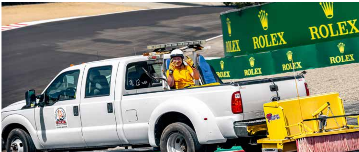
Ever go down the Corkscrew? Ever go down the Corkscrew backwards?! This volunteer has!

events, you also get a guest pass for your spouse or for a friend. We feed you lunch; and everyday, all the volunteers meet up for a social that usually includes a dinner. Quite a deal, especially when you consider as a volunteer, you get the best seat in the house.