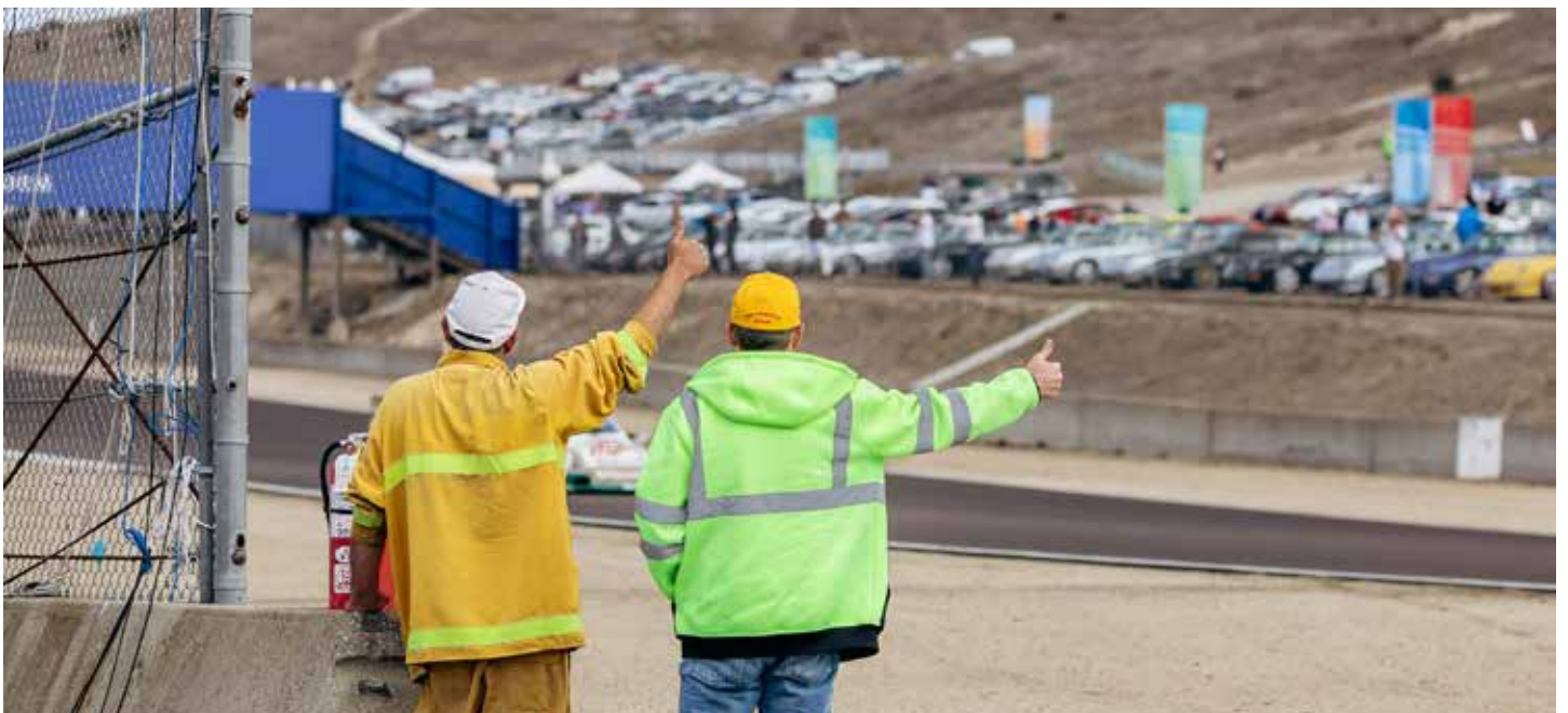
E Crew acknowledging the drivers at the end of a session.