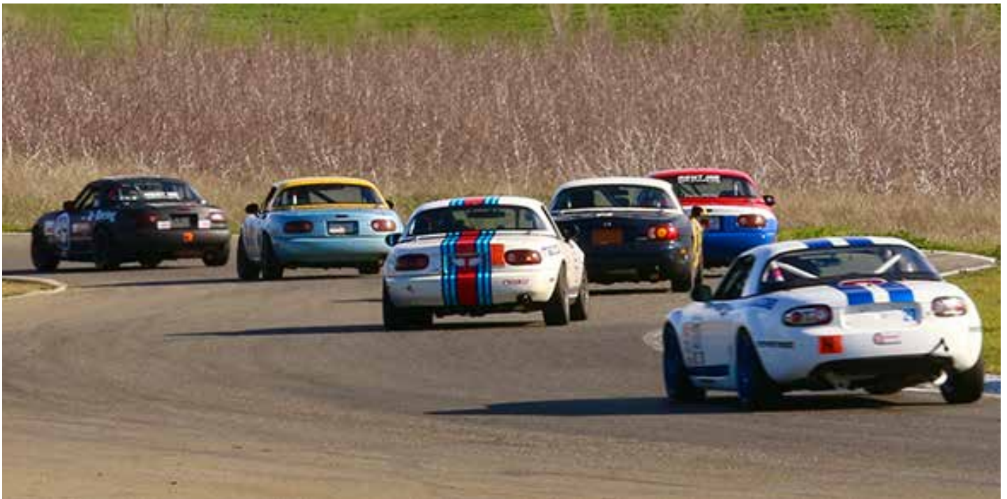
All novice drivers are required to have a fluorescent orange placard on the rear of their car.

Your racing gear will be inspected by a SCCA Tech official prior to your going on the track. The gear is also inspected every year to ensure