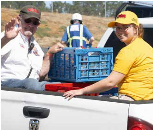
Delivering the lunches during the Indycar Weekend.

F1 events. Think Communicating, Intervention, Scrutineering, Pit/Grid/Paddock Marshal, and hospitality. Your SCCA Worker License is like what the E Ticket used to be at Disneyland.