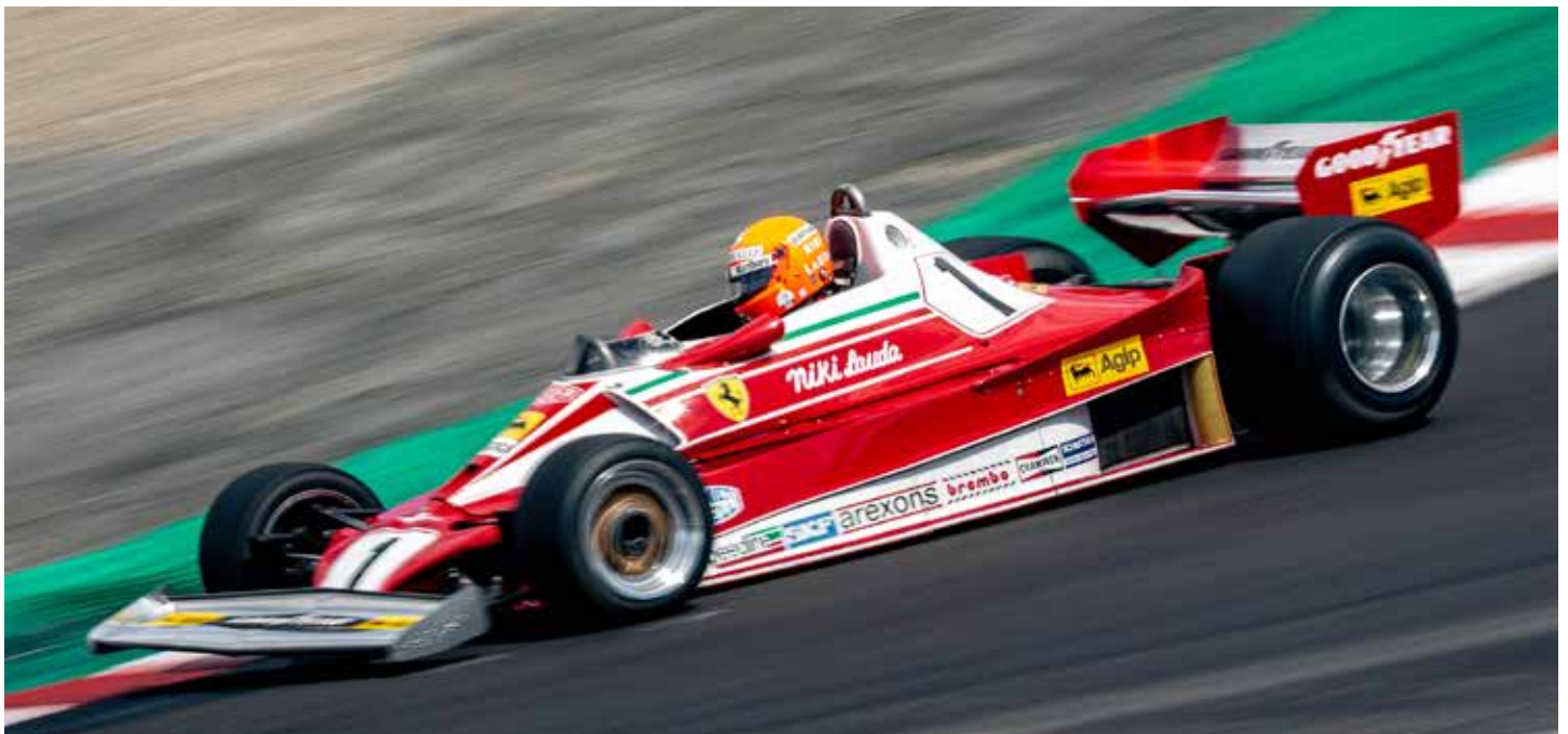
Do you like the sound of 12 cylinder F1 engines? Hear them as a volunteer at the Rolex reunion. Earplugs optional.