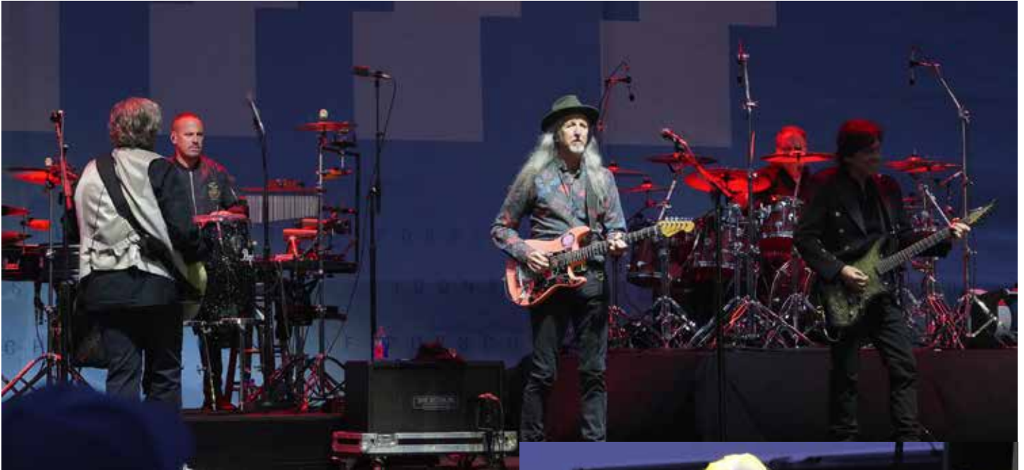
Doobie Brothers played at Rennsport.

7-11 turns into a car show, because the entire area is over-run by car enthusiasts driving their cool cars.