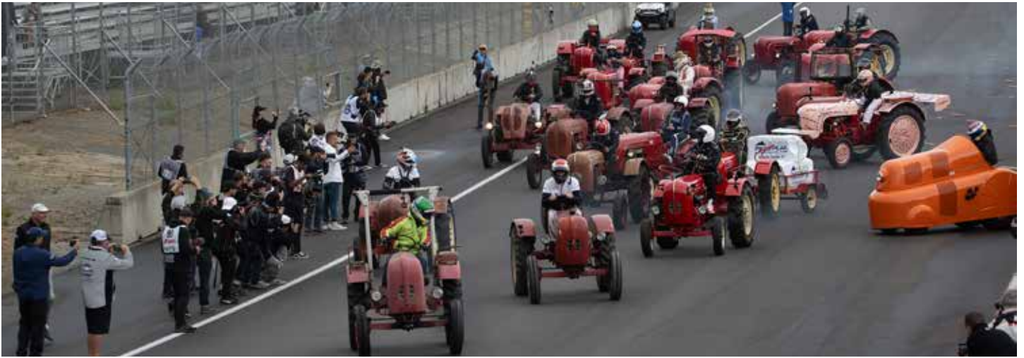
The scrum to see you grabs the lead.