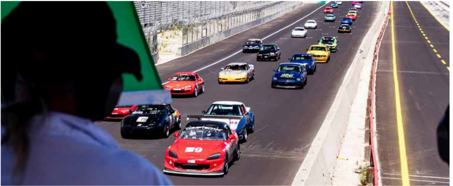
The start of the Group 5 Sunday Race.