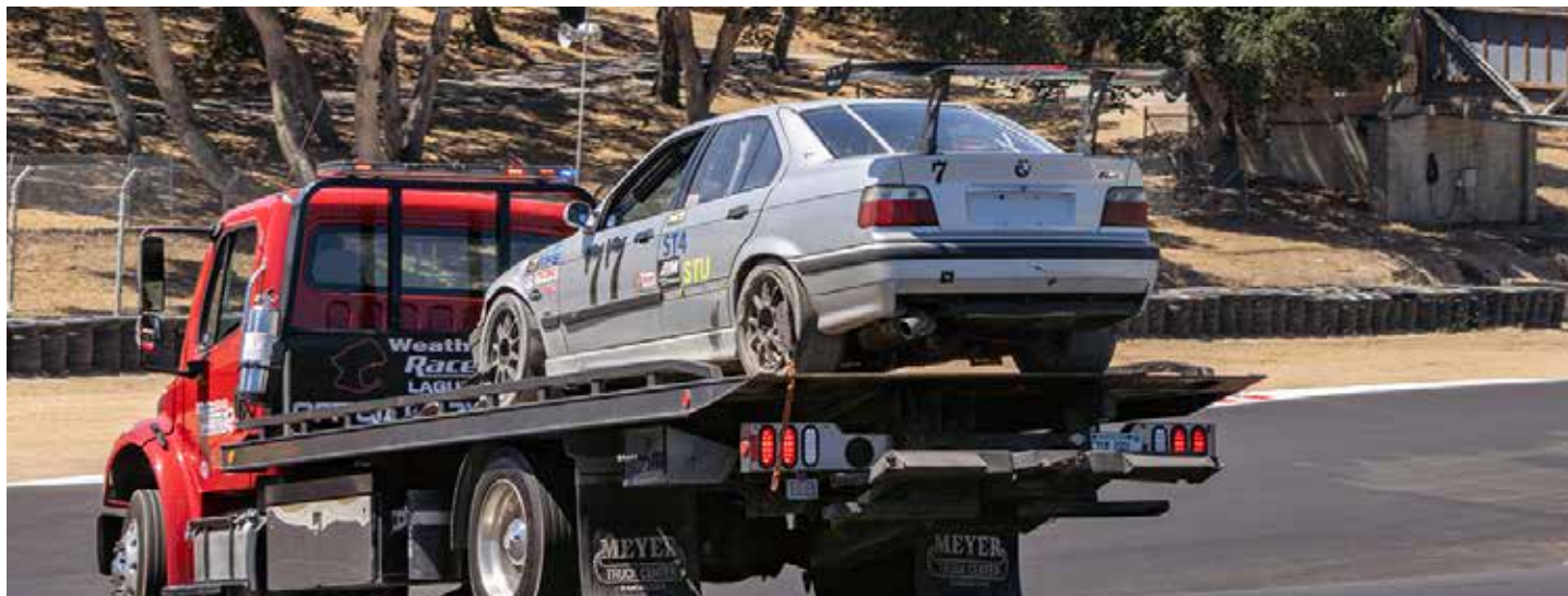
The aftermath of the Hazelton- Powell contact in turn six.

Forty-eight cars lined up for Group 5 Race One on Saturday afternoon. It was 2 o'clock and the temperatures were nice and mild. We were hoping for a good race. With 45 cars of varying speeds, it was going to be a crapshoot as to whether or not that many cars could go to 30 minutes without bringing out a full course caution.