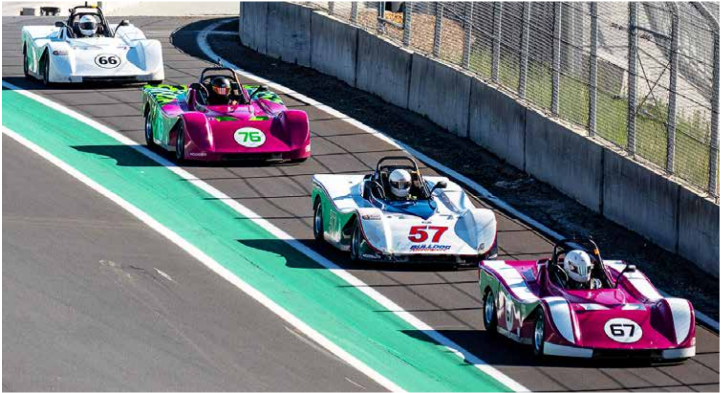
Group 6 Qualifying - Sunday.