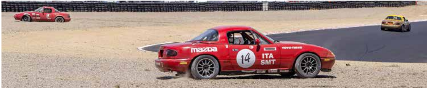
Two SMT veterans off the track. #14 Alan Gjedstad and #9 Roland Kamber.